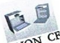
NON CFC APPLIANCES